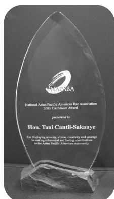
The National Asian Pacific American Bar Association's 2003 Trailblazer Award

HON. GOODWIN H. LIU Associate Justice Supreme Court of California 2011–