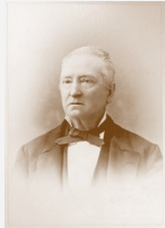
Hon. Nathaniel Bennett Associate Justice Supreme Court of California

California's highest court convened for the first time on Monday, March 4, 1850 in San Francisco. On that day, two of the court's three justices, Associate Justice Nathaniel Bennett and Associate Justice Henry Lyons, met to begin the work of organizing the court. Justice Bennett and Justice Lyons were joined by Chief Justice Serranus Clinton Hastings on Thursday, March 7, 1850.